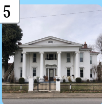
HARTON FUNERAL HOME 1507 S. MAIN STREET