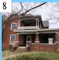
SITE OF CAYCE'S FIRST READING 520 W. 7TH STREET