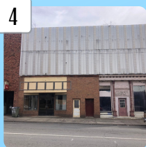
HOLLAND'S OPERA HOUSE 808 1/2 S. MAIN ST.