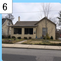
CAYCE HOME 1910 S. MAIN STREET