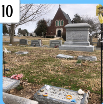
RIVERSIDE CEMETERY 530 N. MAIN STREET