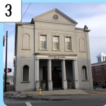
SITE OF THE THOMPSON BUILDING 700 S. MAIN STREET