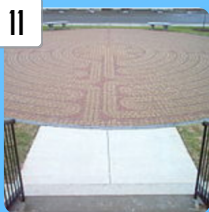
THE LABYRINTH 7TH & LIBERTY STREET