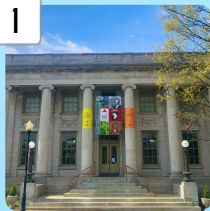
PENNYROYAL AREA MUSEUM 217 E. 9TH STREET