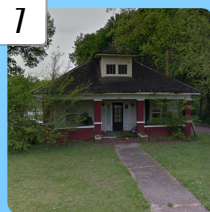
CAYCE HOME 1821 E. 7TH STREET NO LONGER STANDING