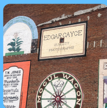
FOUNDERS SQUARE 9TH & MAIN STREET BONUS PHOTO OP WITH CAYCE MURAL!